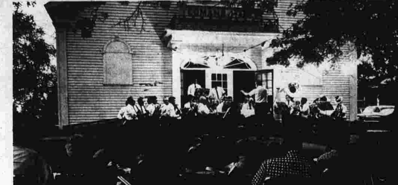
On a warm summer evening, an outdoor band concert presented by visiting firemen from Willimantic.