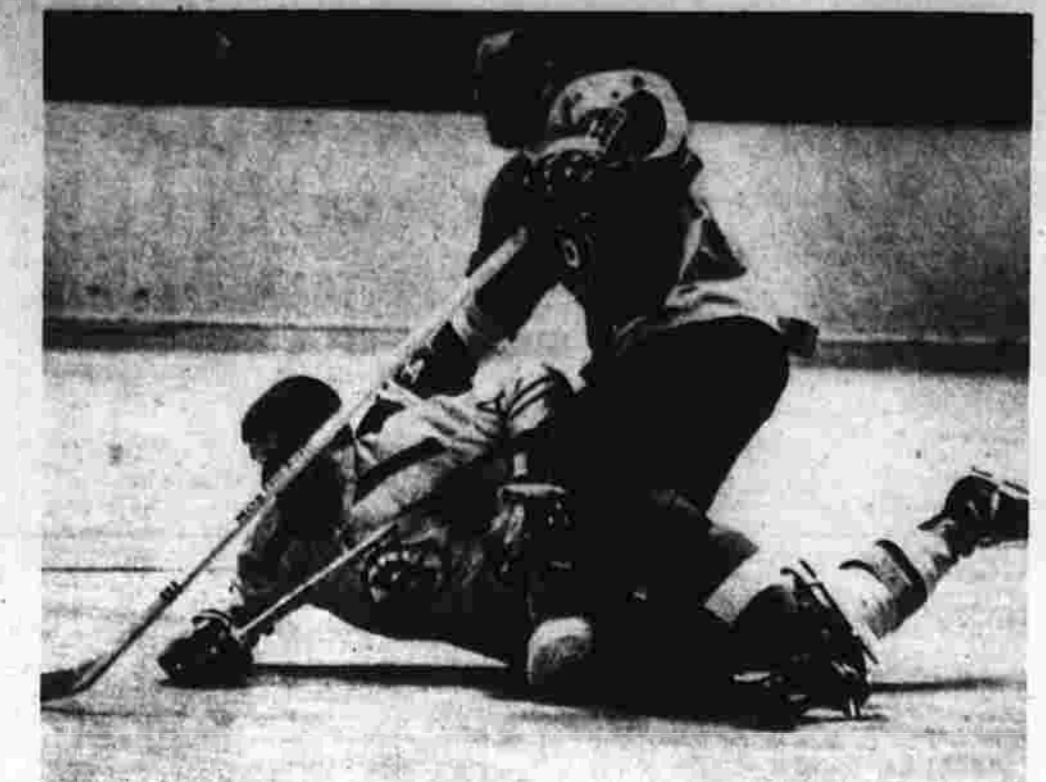
RIDE 'EM COWBOY—Pat Hannigan of Philadelphia straddles Bobby Orr of Boston as they collide during skirmish for puck.