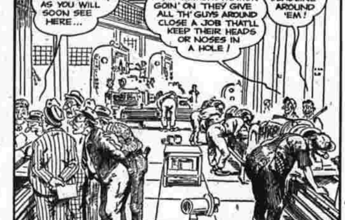
OUT OUR WAY