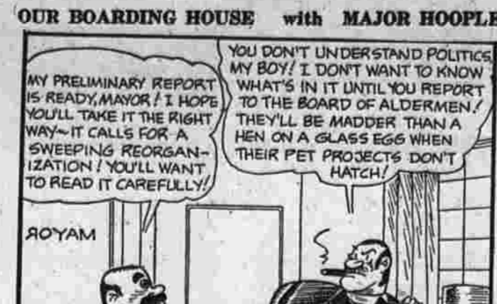
OUR BOARDING HOUSE with MAJOR HOOPLE